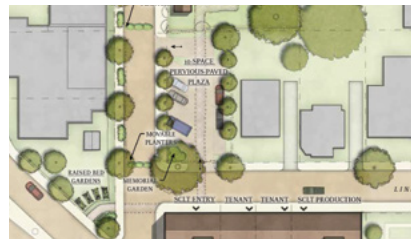
BELOW & LEFT: Images from Union Studios' concept design of 404 Broad Street

With our $4 million GROW! Capital Campaign entering the home stretch, we plan to start renovating the building at 404 Broad Street in late 2020. In addition to the physical improvement our project will bring to the area, RI Housing will replace dozens of boarded-up buildings in Trinity Square with 70 affordable housing units. To prepare for our move we've actively participated in Trinity Square Together, a group of neighborhood stakeholders working to improve the area's quality of life. We look forward to bringing jobs as well as more healthy produce and locally owned food businesses to our neighbors in Trinity Square!